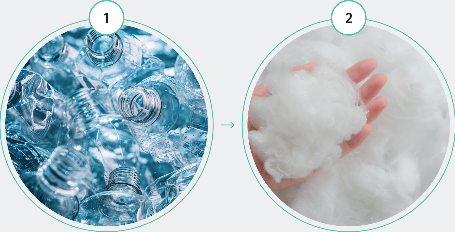
Acoufelt's WoodBeQuiet™ planks collection is made from post-consumer recycled plastic drink bottles, diverted from landfill.