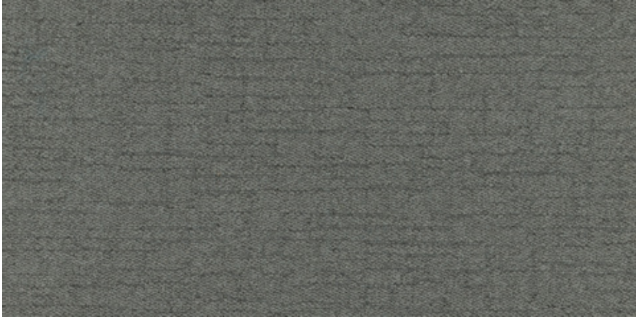
Kettle - IN05