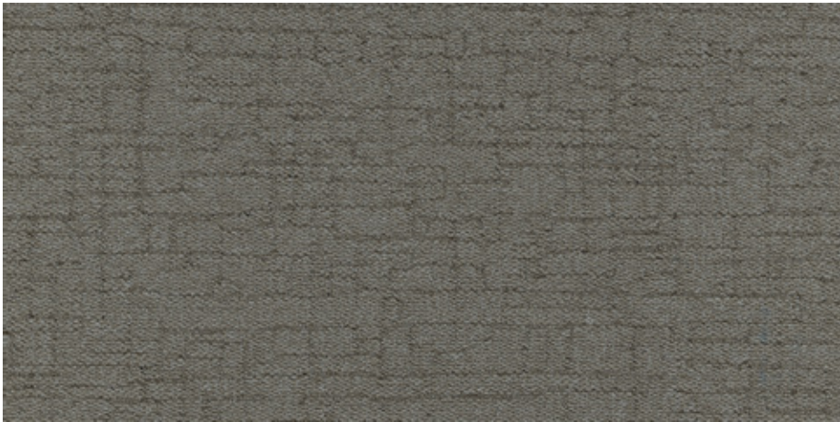
Smoke - IN02