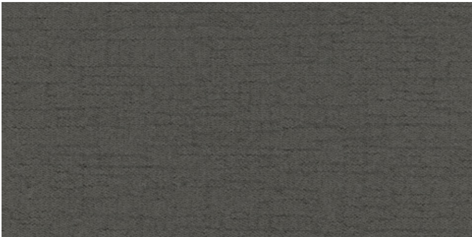
Smoulder - IN06