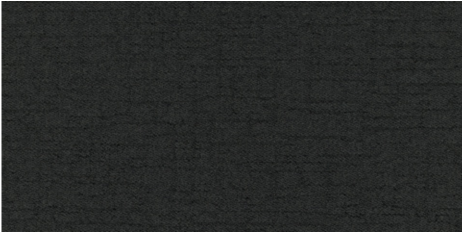
Cinder - IN08