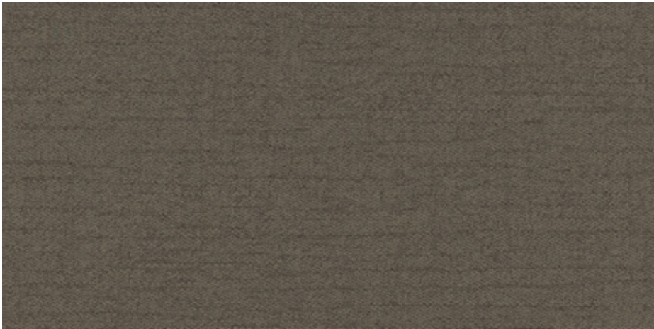
Glow - IN04