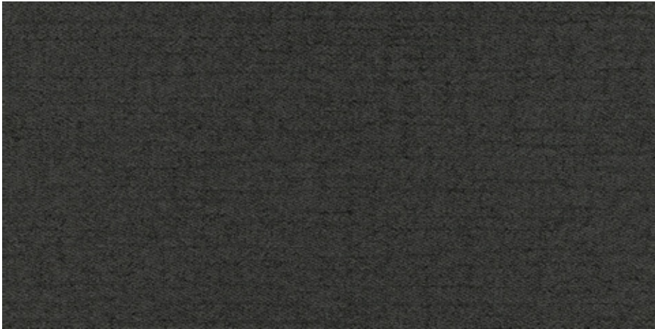
Crackle - IN07