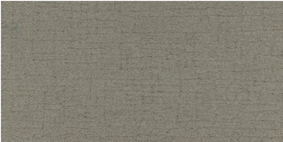
Hearth - IN01