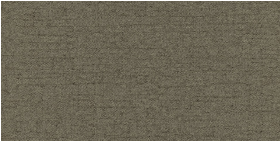
Spark - IN03