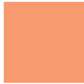
Peach LRV – 29.00%