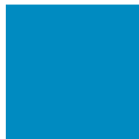
Azur LRV – 18.00%