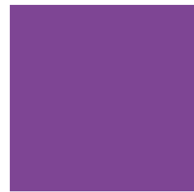
Berry LRV – 12.00%