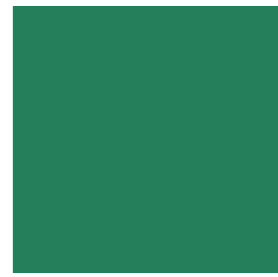
Thistle LRV – 13.00%