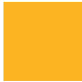
Butter LRV – 62.00%