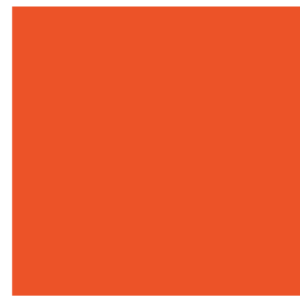
Carrot LRV – 20.00%