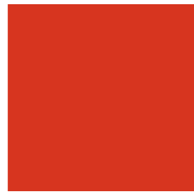
Lipstick Red LRV – 12.50%