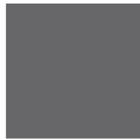
Slate LRV – 12.50%