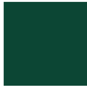
Oregano LRV – 8.80%