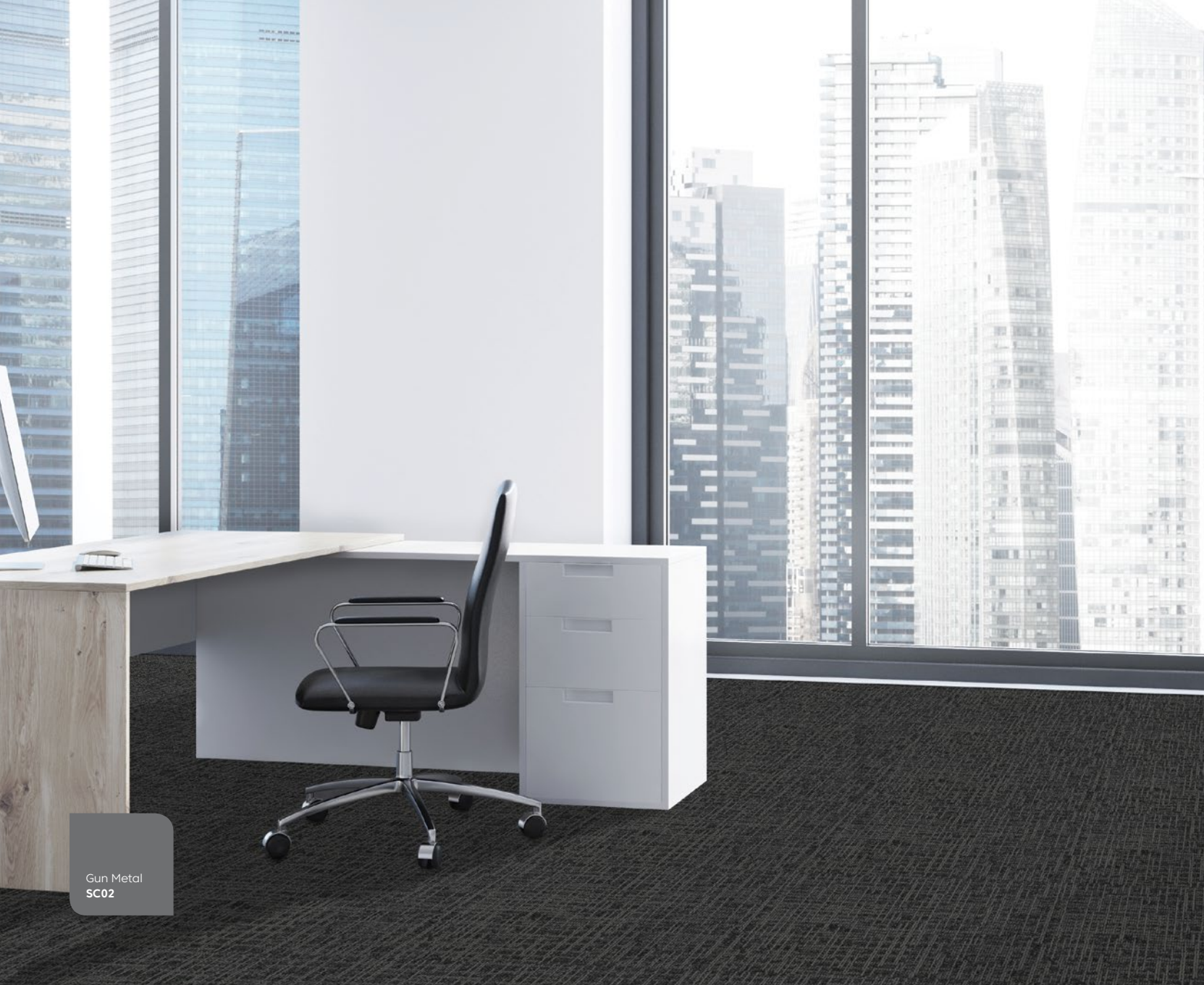
Gun Metal SC02